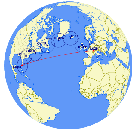
Figure 1: Direct route ZRH-MIA with 60min range rings

No matter the name though, the principle of operations is the same for all. By certifying aircraft, crew and operator the risk of such extended overwater operations can be mitigated to a level that is acceptable to the legislator. By default, a twin engine aircraft is allowed to fly a maximum of 60 minutes, a three or four engine aircraft a maximum of 120 minutes away from a suitable diversion airport.