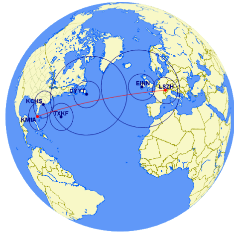
Figure 2: The same route but with ETOPS 180 applied

As an example, for the A330 at my employer, the maximum diversion time approved is 180 minutes at a single engine cruising speed of 410 kts. As only the still air case needs to be considered, TAS and GS are equal for the purposes of ETOPS certification, thus those 3 hours of diversion time at 410 kts allow for a maximum diversion distance of 1230 Nmi.